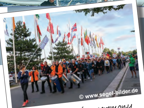
Kiel's big opening ceremony

This article was first published in Seahorse International Sailing Magazine www.seahorsemagazine.com